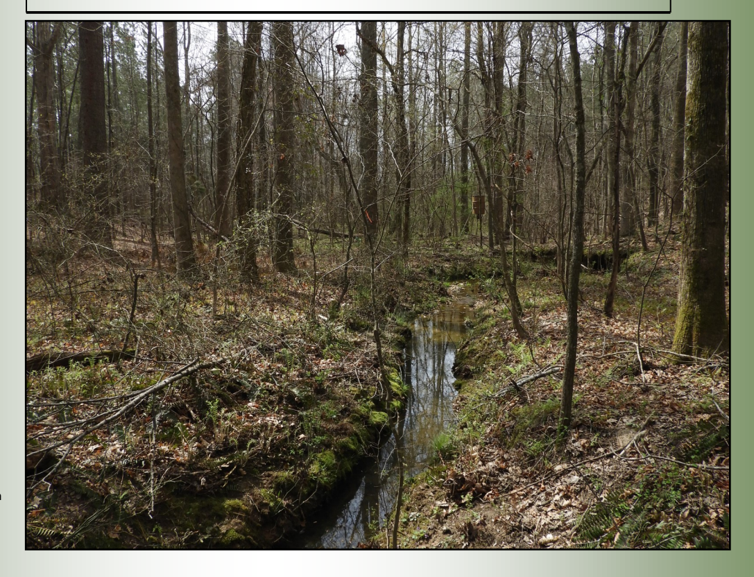
133.94 Acres | Hagood Road | Haralson County, GA | 30176