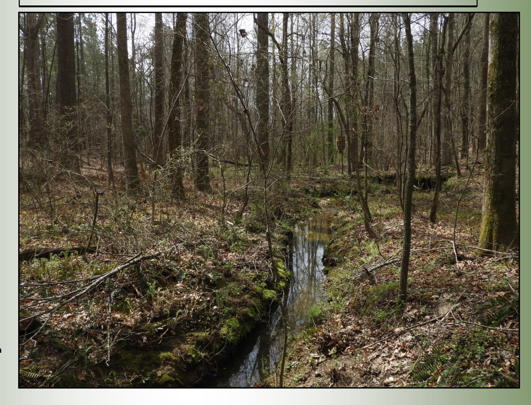
133.94 Acres | Hagood Road | Haralson County, GA | 30176